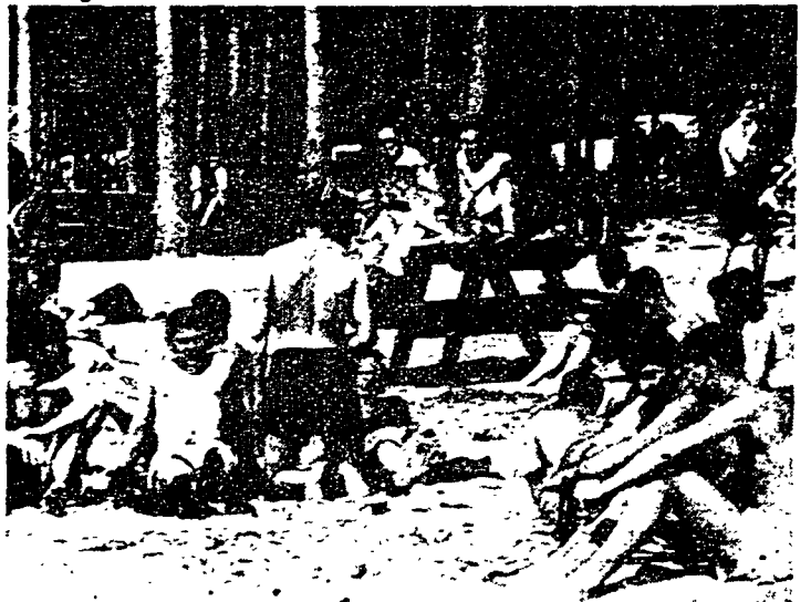
TYPICAL PENN STATE weather at work again. Last Saturday students flocked to Whipple's Dam to bask in the summer-like sun. However, sudden drop of the mercury has put all thoughts of this sort into the background lately.