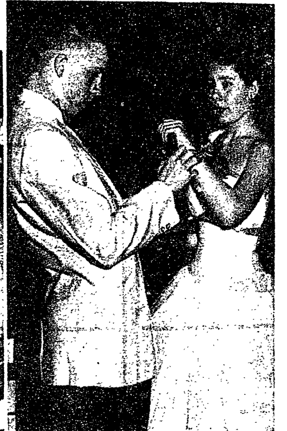
OUCH—Watch that pin. This coed gives a watchful look as her escort pins on her corsage at the Senior Ball.