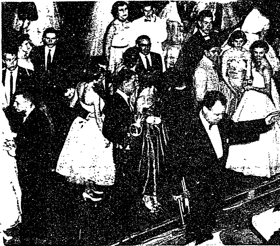
SPRINGTIME WAS THE THEME at the Senior Ball last night where 1200 couples danced to the music of Billy Butterfield and his orchestra.