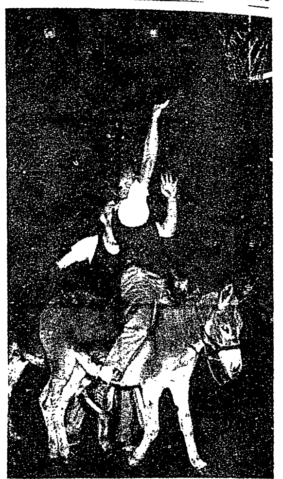
IT'S A RINGER—Player concentrates on shot but his 'partner' doesn't want to cooperate.