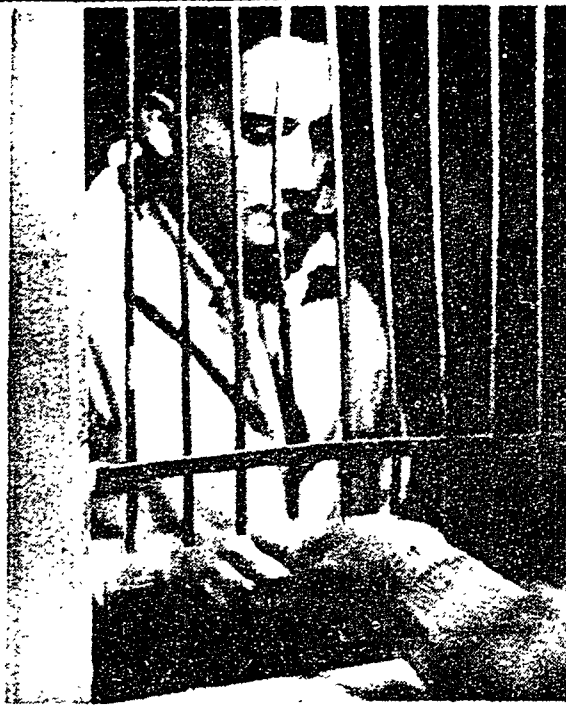
NO, IT'S NOT the Ugly Man behind bars but a cashier selling one of the 42,554 tickets purchased at the Carnival.