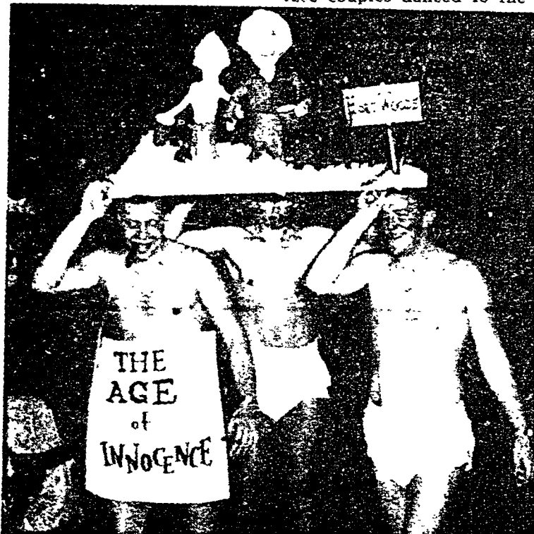
BABES IN THE WOODS. Members of Sigma Chi display their Mad Hatter's creation entitled 'The Age of Innocence.'