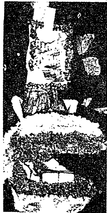
THE HORSE'S MOUTH is the title of this entry in the Mad Hatter's contest.