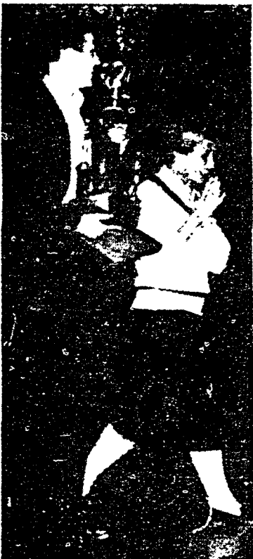
THE WINNERS race home with the Spring Week trophy.