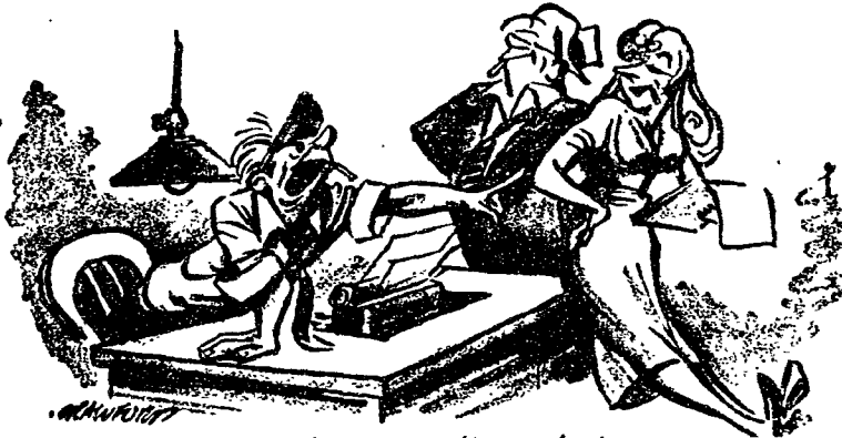
... Ethel, you cover the men's gym.

The editor—let's call him D. Fermin Bohorquez, a typical enough name—calls his staff together first thing in the morning. "All right, you guys," he says, lighting a Philip Morris, which, naturally, is the favorite cigarette of newspapermen, and of anybody else who knows a hawk from a handsaw. "All right, you guys," says D. Fermin, "this here ain't no ladies whist society, this here is a newspaper. So get out there and get the news. Get it first, get it quick, get it right! Ed, you cover the ag campus. Phil, you cover the school of mines. Wally, you cover home ec. Sam, you cover buildings and grounds. Ethel, you cover the men's gym. . . . All right, get going!"