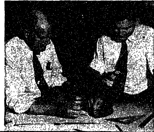
Many engineering graduates would like to be concerned with air power of the next generation. One way to fulfill that ambition is to pursue a career alongside engineers who have consistently produced the world's best aircraft engines.

Most major U. S. airlines, recognizing the future of jet flight in commercial transportation, have placed their orders for jet-powered transports. Of added significance, however, is that American-made equipment will be flown also by foreign airlines in the age of jet travel.