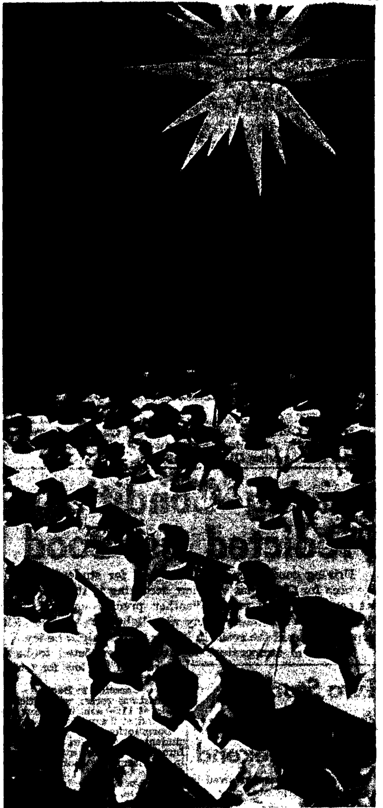
Chapel choir presents annual Christmas candlelight service Saturday night in Schwab Auditorium.