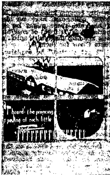
Part of Nittany Dorm 39 winning window display.