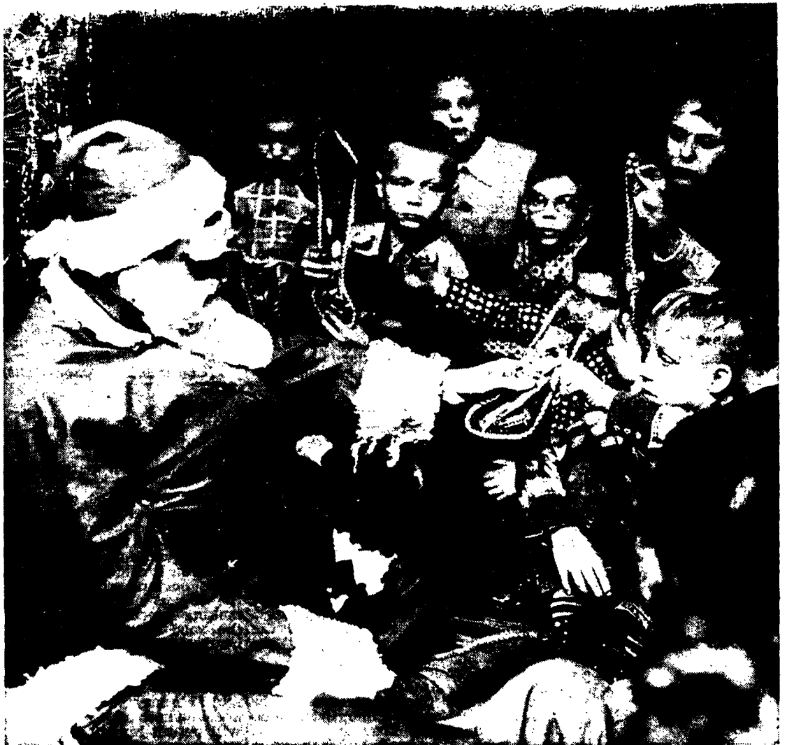
Every Christmas party has its Santa Claus, and this time the Alpha Epsilon Pi's put on a real show for the local underprivileged children.