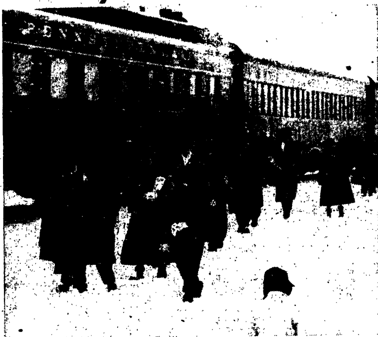
WARMLY-BUNDLED Pittsburgh fans trod through the falling snow towards Beaver Field Saturday after leaving one of the special trains which bore them to State College shortly before the start of the Pitt-Penn State football game.

Five finalists will be selected by judges from Penn Military College, Chester, Pa. The queen will be selected at the ball by the three professors of military science and tactics.