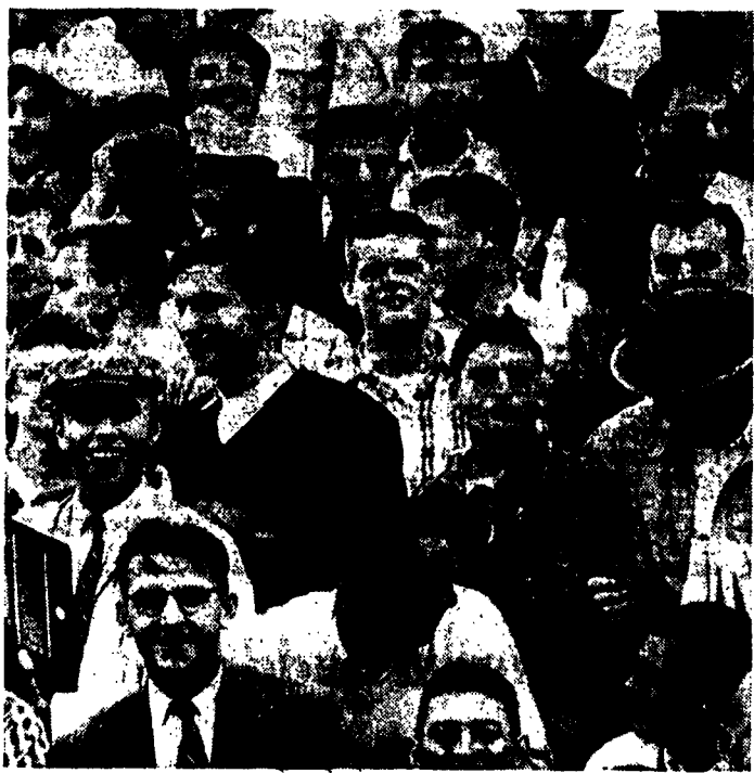
It didn't rain for the BU game.