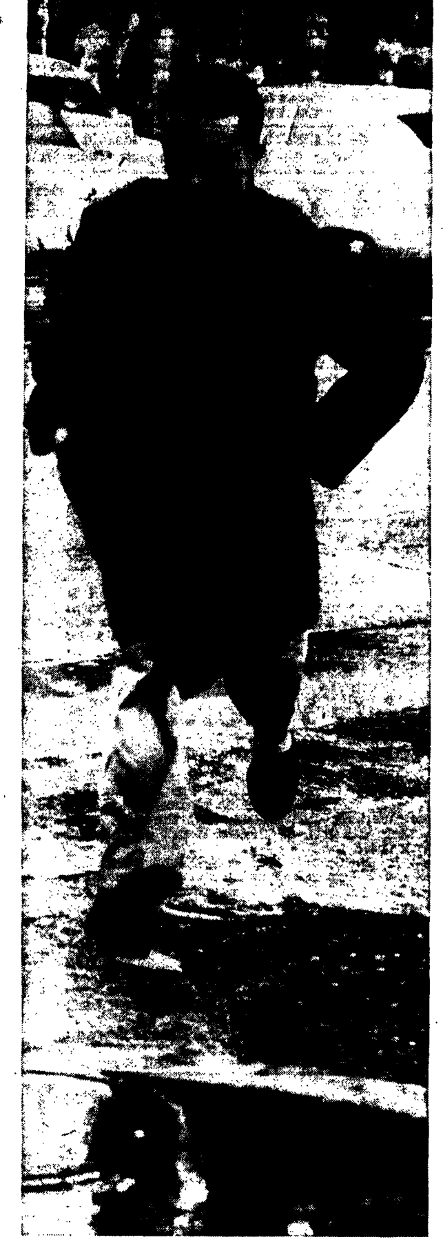
Oops-almost didn't make it.

No, there's been no change, homecoming festivities. She "The theme of this weekend alumni, it still rains at Penn