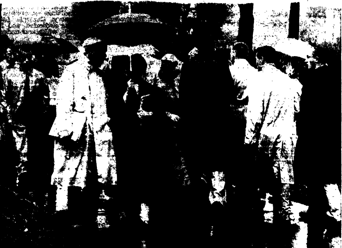
But it rained on campus yesterday-

A Daily Collegian Photo-Feature By RON WALKER