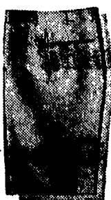
JACK HARPER WALK SHORTS

Fashioned in the Jack Harper tradition... our walk shorts are cool and smartly casual. Distinctly designed, these fabulously comfortable shorts belong in every warm weather wardrobe. Available in plain or pleated models.