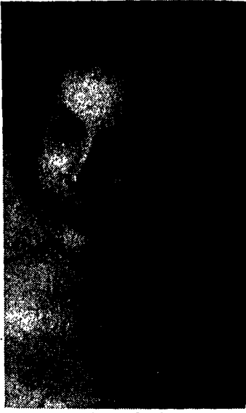
Faith Gallagher Matrix Girl