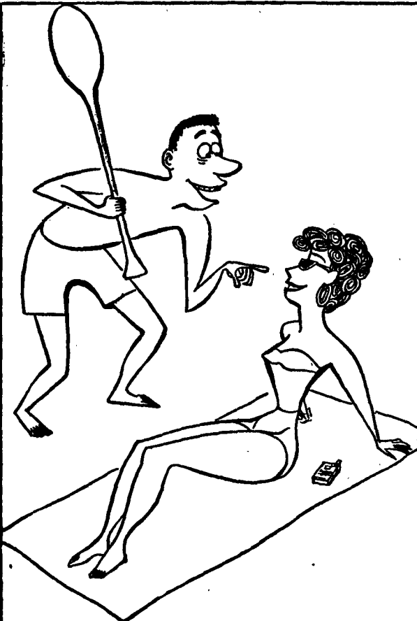
And then you find her sunbathing next to your house on the bay...