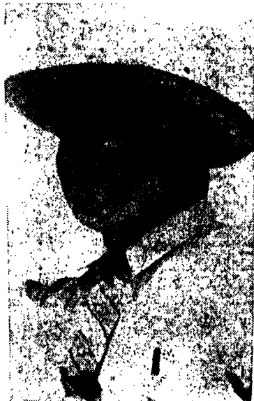
Paul Tharp Dies Suddenly

WHEN YOUR typewriter needs repairs just dial AD 1-2492 or bring machine to 633 W. College Ave. Will pick up and deliver.