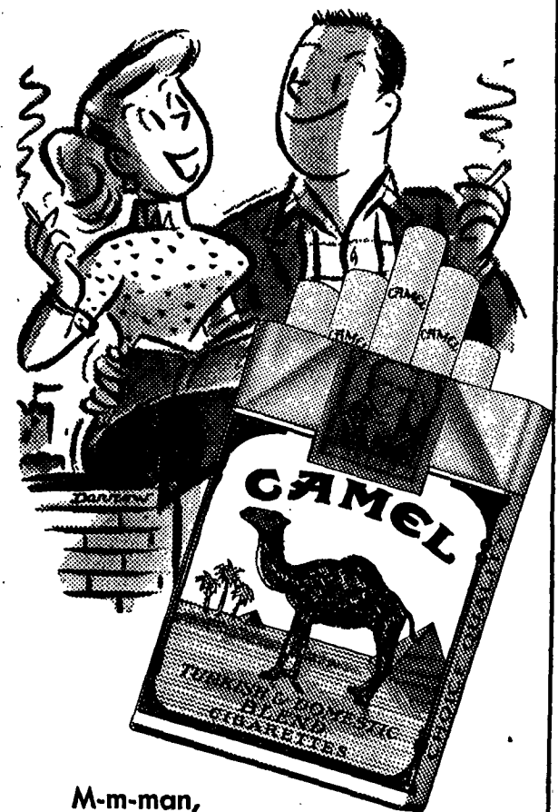
M-m-man, that's PURE PLEASURE!

For more pure pleasure... SMOKE CAMELS! No other cigarette is so rich-tasting, yet so mild!