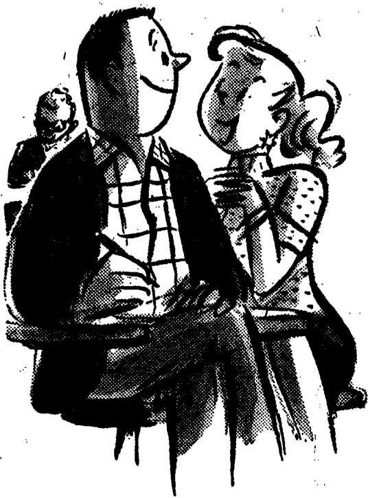
Then turns to you and whispers, "Will you help me after class?"