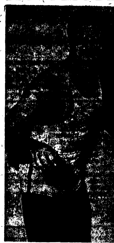
Dave Bates Lehigh 137 Pounder