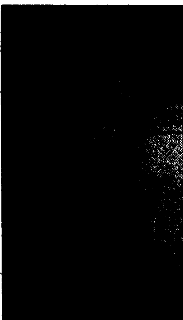
Skeets Haag East's Best on Rope