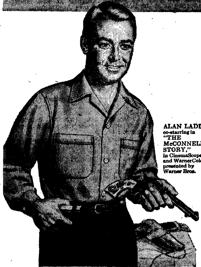
ALAN LADD, co-starring in "THE MCCONNELL STORY," in CinemaScope and WarnerColor presented by Warner Bros.