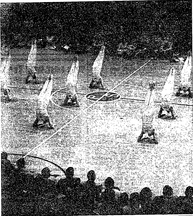
team, performs on the uneven parallel bars. Picture on the right shows men in their dazzling high table vaulting routine. More than 6000 saw the Swedes in their second Rec Hall appearance.