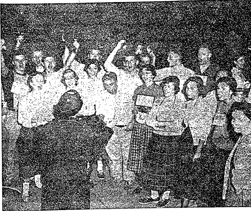
First came Customs (upper left) that great big way of welcoming the freshmen to Penn State. Enforcement was lax as usual except on Joint Custom Days when men could haze women.