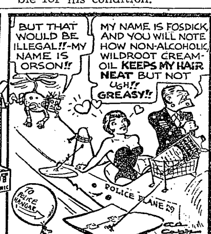
ALCOHOLIC TONICS DRYING OUT YOUR SCALP ? TO GET NON-ALCOHOLIC TO WILDROOT CREAM-OIL, CHARLIE -