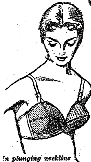
In plunging neckline