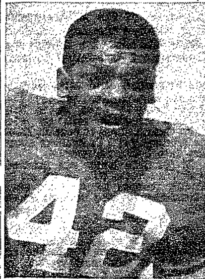
Lenny Moore Ranked Among the Leaders

Boston University moved into the number one position after its 41-19 win over Syracuse. The Terriers own a one point lead over second-place Army, who moved up by turning back undefeated Duke, 28-14. Colgate and Boston College also placed in front of the Lions. Navy dropped from second to seventh after its loss to Pitt.