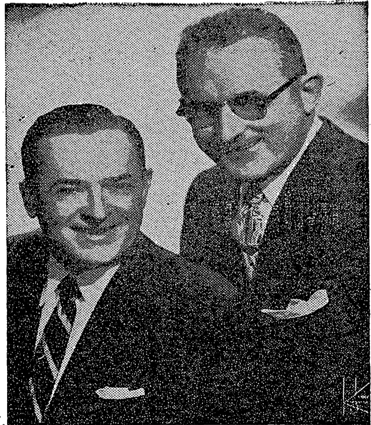
Those Fabulous DORSEYS TOMMY and JIMMY DORSEY

Fraternity Dances Players Show Football - Holy Cross Band Day