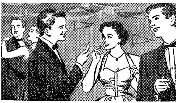
SUCCESS STORY: Camels — America's most popular cigarette... by far!