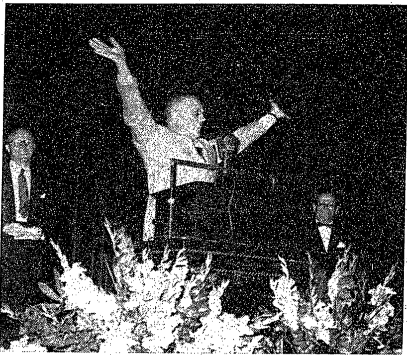
PRESIDENT MILTON S. EISENHOWER welcomed the new freshman class Monday night in Recreation Hall. Jesse Arnette, All-University president, and David R. Mackey, Burgess, also extended greetings. In the background are Wilmer E. Kenworthy, left, director of student affairs, and Ray V. Watkins, University scheduling officer.