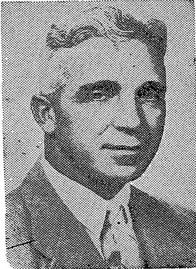
Rip Engle Starts Another Campaign

The physical education major activity fields are broken up into eight week blocks. Thus a student may take tennis as his major activity course for the first eight weeks of the semester and basketball for the remaining eight weeks of the semester.