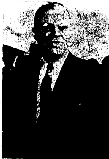
Milton S. Eisenhower University President

"I trust you will enjoy yourself here for the next four years or more, but also I hope you will always keep foremost in your