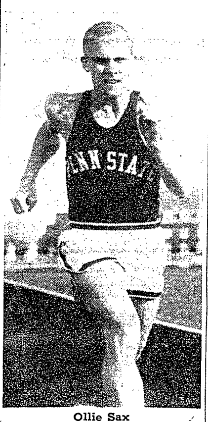
Top middle distance runner