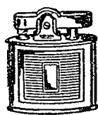
RONSON POCKET LIGHTER Press, it's lit, release, it's out!

—Your choice of a comfort-easing single or double-breasted AFTER SIX dinner jacket with the new miracle "Stain-Shy" finish . . . midnight blue summer formal trousers . . . cummerbund and tie "Formal Pak" . . . and AFTER SIX dress shirt.