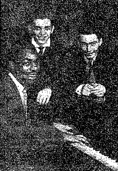
RUDY BLACK TRIO at the TOWN HOUSE 7 p.m. to 12 p.m. Daily