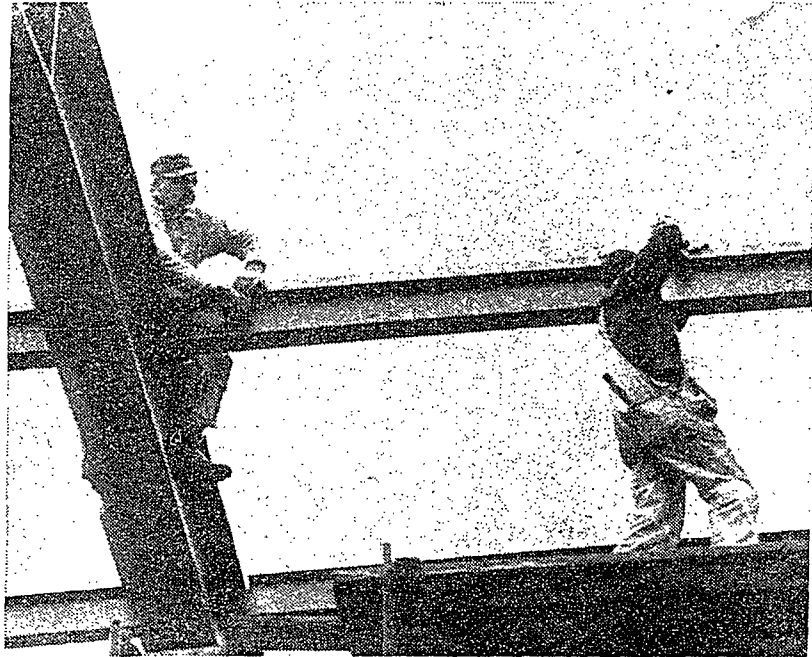
TWO WORKMEN PLACE steel beams to support the roof on one wing of the Student Union Building. Officials have announced that all the major steelwork is now completed in the building which this month marks its twelfth month under construction since ground was broken. Work is progressing rapidly with the unseasonably good weather.