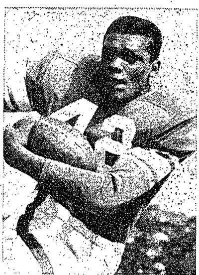
Lenny Moore Sterling Halfback