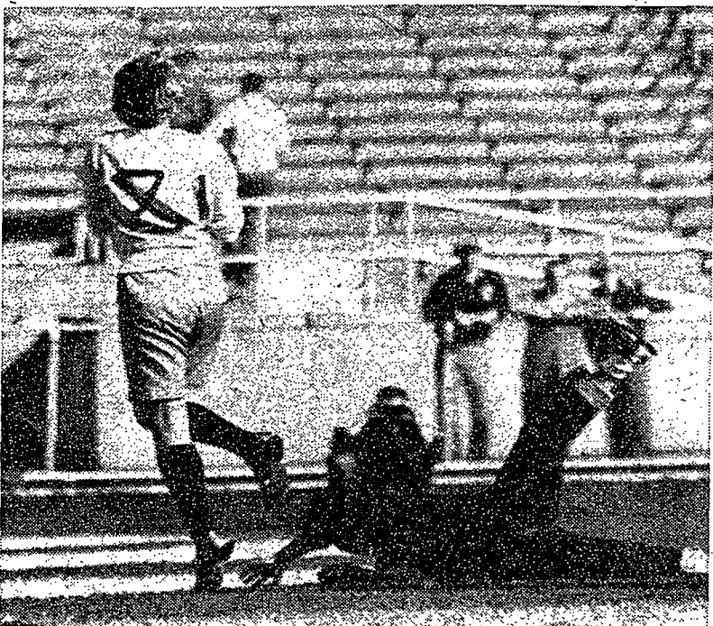
A PI PHI PLAYER takes a spill attempting to stop a Kappa end run during the Powder Bowl game at Beaver Field Saturday. The proceeds from the game going to the Campus Chest, total approximately $500 from the estimated attendance of 2000. The sororities plan to make the Powder Bowl an annual event of the Campus Chest drive.