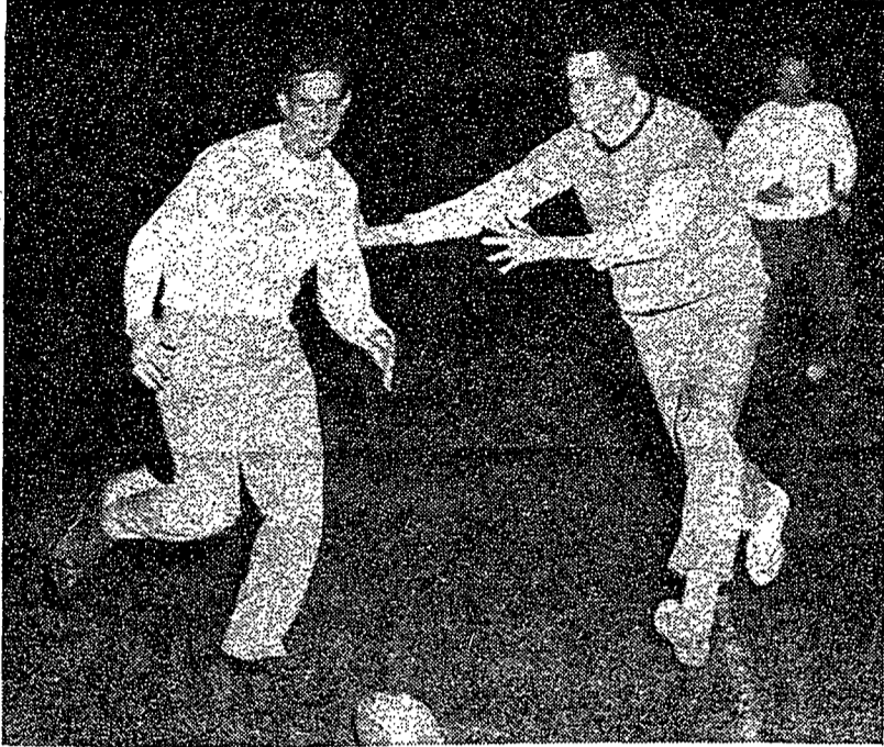
PLAYERS CLOSE in on a pass that went awry for Delta Sigma Phi. Although this last pass was incomplete Delta Sigma Phi went on to clip Tau Phi Delta, 12-0, in last night's intramural football activity. This was one of the four games on the slate last night as intramural action resumed after several days interruption due to rain.