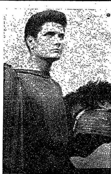
AMPHITRYON — a great general. He loves his wife — but so does Jupiter.