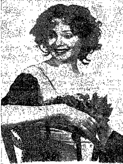
Elsa Lanchester Characterizations Monday

Both directories are priced at 35 cents and are sold at the recorder's desk, 4 Willard. Book stores downtown also are selling copies of the Student Directory.