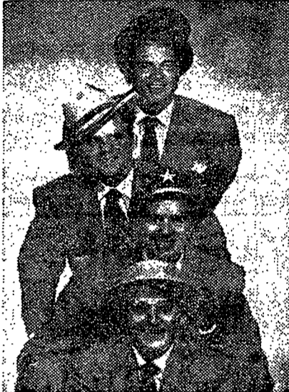
The Madhatters Supporting comedy quartet