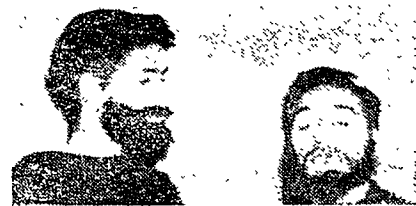
THE PASSION PLAYERS temporarily jobless . . .