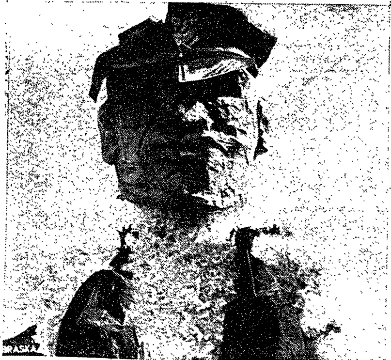
HEADS TURNED as the huge, nodding head of Lambda Chi Alpha's winning motorcade float greeted the crowds around Beaver Field Saturday. The float symbolized Pennsylvania's agriculture, industry, and armed forces.