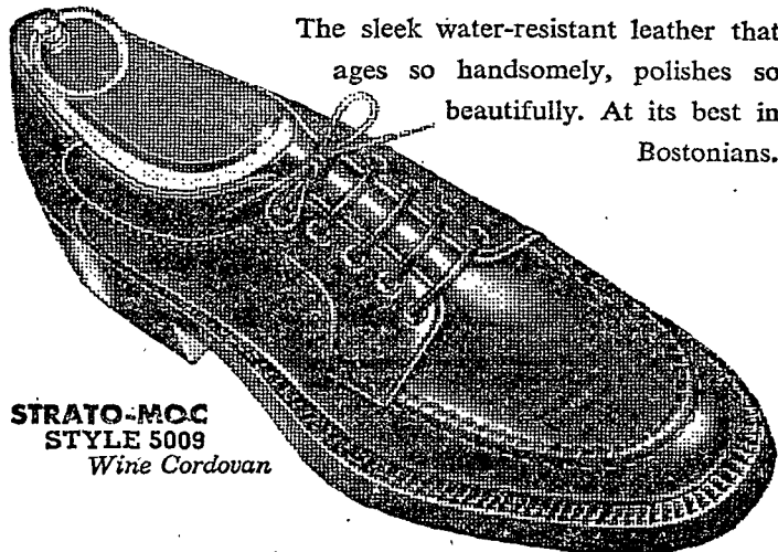
STRATO-MOC STYLE 5009 Wine Cordovan

The sleek water-resistant leather that ages so handsomely, polishes so beautifully. At its best in Bostonians.