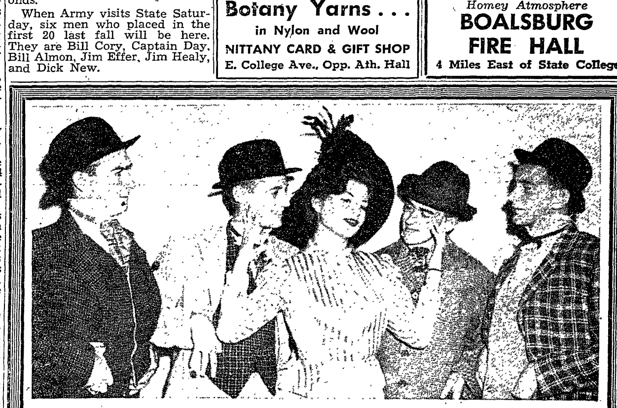
Your Homecoming Queen and the Pershing Rifles at their Sparkling Best.