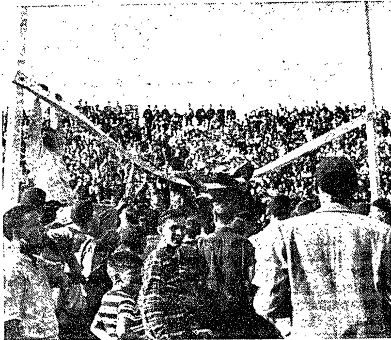
THE GOAL POSTS bend like rubber as they are torn down prematurely at Saturday's game with Temple. Jubilant College students led by cheering freshmen swarmed onto the field late in fourth period to bring the posts crashing to the ground.