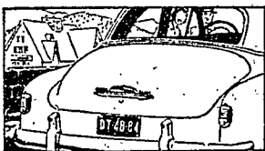
EXTRA BEAUTY AND QUALITY of Body by Fisher