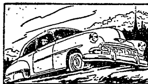
EXTRA SMOOTH PERFORMANCE of Centerpoise Power