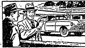
EXTRA PRESTIGE of America's Most Popular Car