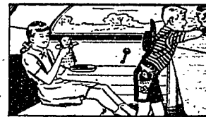
EXTRA STRENGTH AND COMFORT of Fisher Unisteel Construction