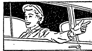
EXTRA STOPPING POWER of Jumbo-Drum Brakes