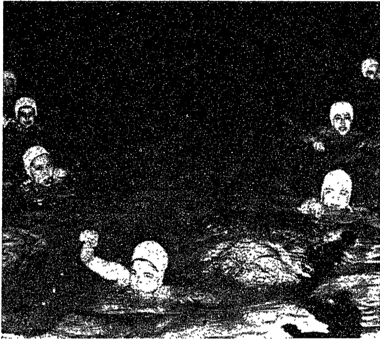
ONE OF the scenes from the Women's Recreation Association aquacade is pictured above. Final performances for the aquacade will be presented tonight and tomorrow night. "Rainbow Rhythms" is the theme of the water show.