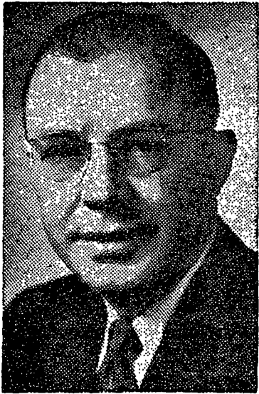
Milton S. Eisenhower