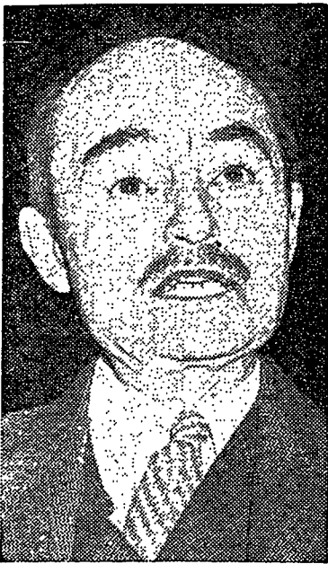
Dr. Francis Biddle

In 1938-39, Dr. Biddle was chief counsel for the joint committee