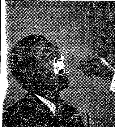
Doctors warn smokers about throats. Kaywoodie Pipes have Three Throat-Guards to give extra throat protection.