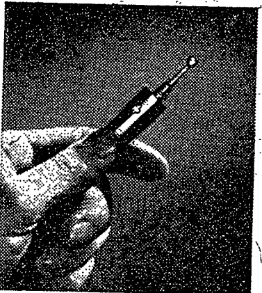
SECOND THROAT-GUARD: Exclusive, patented "DRINKLESS" device. Cuts down irritating tars... keeps every pipeful lit longer.