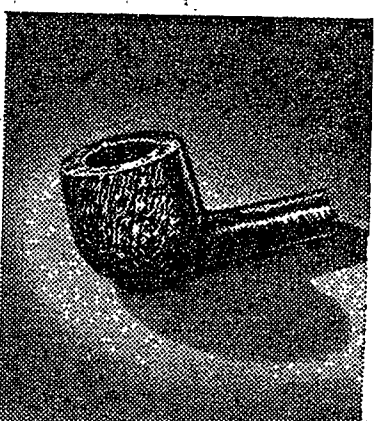
THIRD THROAT-GUARD: World's best imported briar. It's specially heat-resistant and porous. Makes smoke cooler... less irritating.