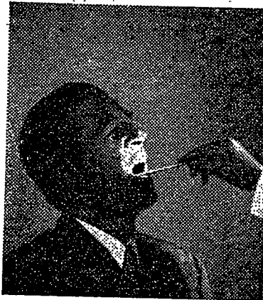
Doctors warn smokers about throats. Kaywoodie Pipes have Three Throat-Guards to give extra throat protection.

It is probable that the first printing done in North America was in Mexico City.