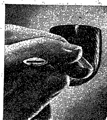
FIRST THROAT-GUARD: "Wider-opening" bit. Spreads out smoke, helps cool it. No hot smoke to irritate throat or "bite" tongue.