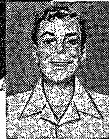
Wear it open for sports, or...

Here's that Gabanaro sports shirt you heard about!"