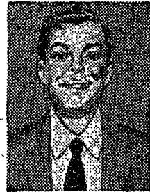
with a tie for stepping out.

Gabanaro... with the amazing new Arafold collar $6.50