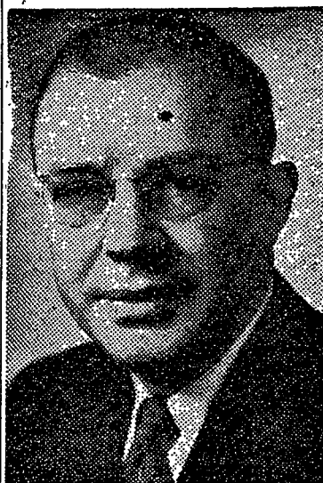
Milton S. Eisenhower