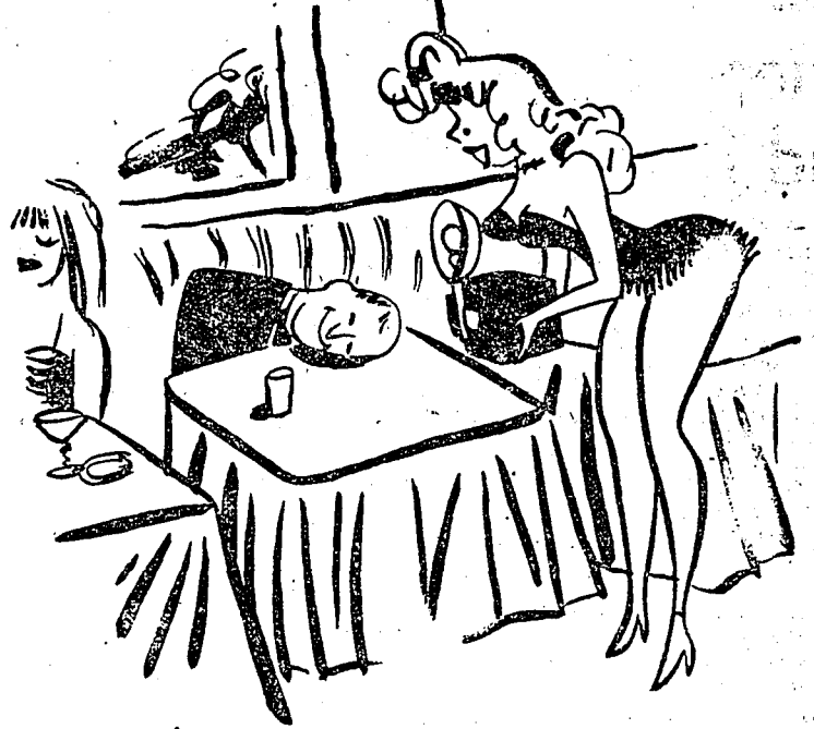
Reprinted from the January 1951 issue of ESQUIRE