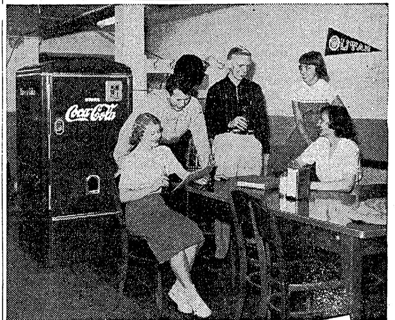
Annex Cafeteria University of Utah Salt Lake City, Utah