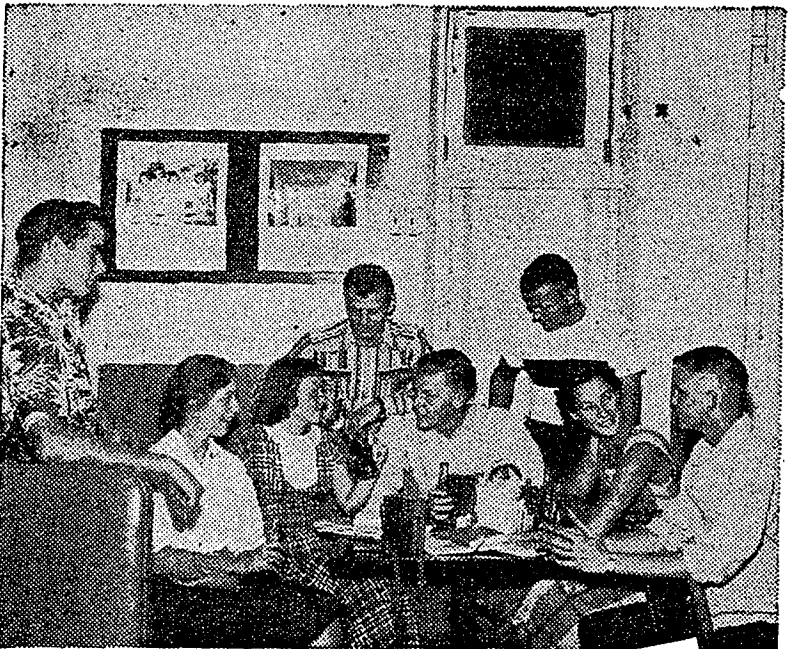
Co-op University of Arizona Tucson, Arizona