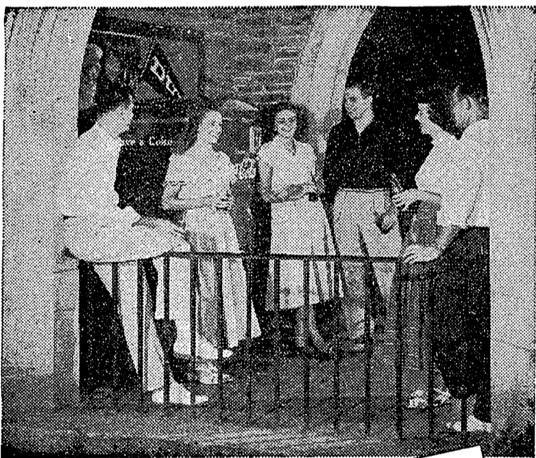
Duke University Durham, North Carolina